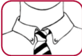
2. Loosen tight clothing.