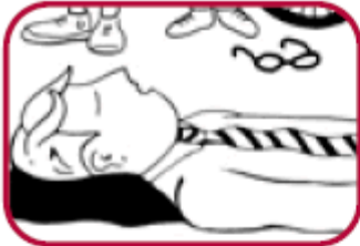
1. Cushion head, remove glasses.

To ensure my safety, here are some steps to follow: